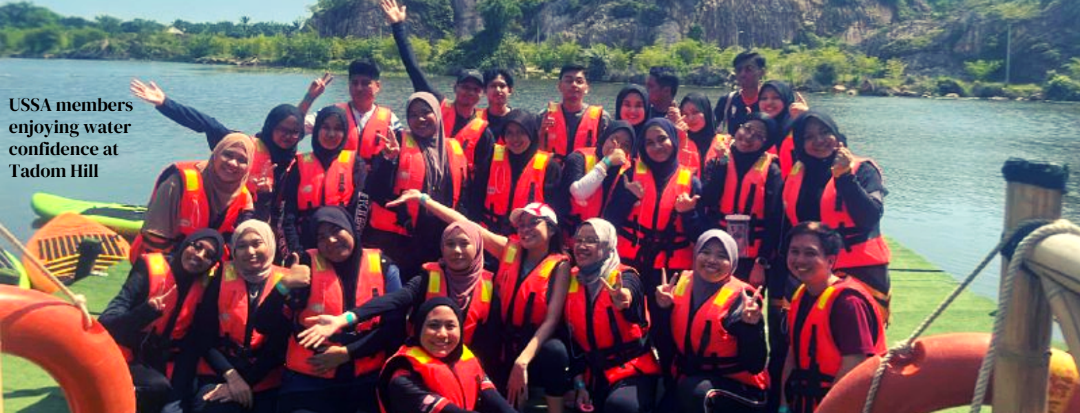
USSA members enjoying water confidence at Tadom Hill