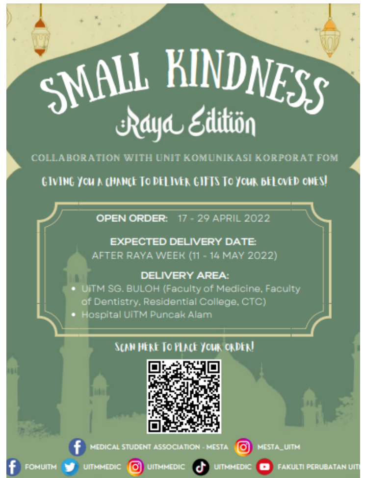
Poster of the Small Kindness Raya program

The objective of this program includes to create compassion between students and lecturers, to create a healthy culture of giving and to collect money for future project expenses. Other than that, this program also gives the committee a chance to run a physical program instead of online they were used.