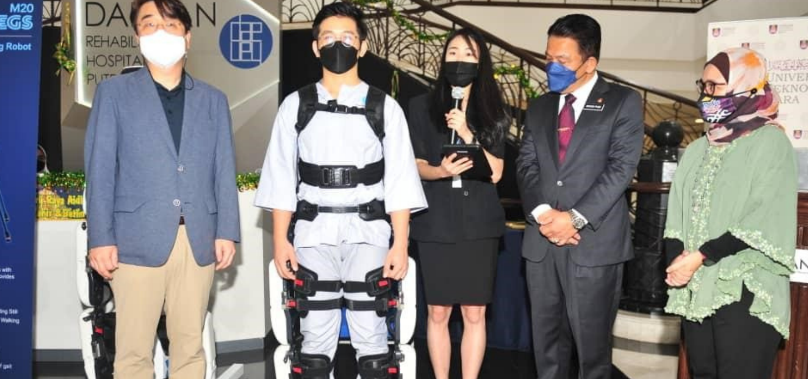
The showcase of robotics in rehabilitation medicine

This MoA will be Malaysia Public University's first collaboration with South Korea, allowing UiTM to serve as a hub for robotics in rehabilitation medicine, specifically for patients with stroke. The use of robotic equipment will allow these patients to experience walking for the first time. The intensity, frequency, task specificity, and bio-feedback from the given treatment also affect the effectiveness of rehabilitation interventions.