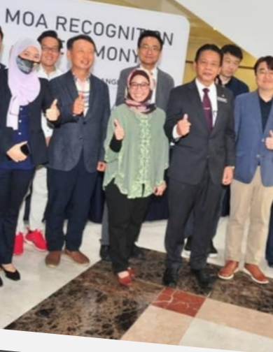
Collection pictures during the ceremony at Daehan Rehabilitation Hospital Putrajaya, Two IOI Resort.

Moreover, the growth of rehabilitation medicine in Malaysia can be advanced through innovative partnerships like the one formed by UiTM-Daehan-Angel Robotics. We are well on our way to achieving this goal, with UiTM now enrolling postgraduate students for clinical masters in Rehabilitation Medicine and opening UiTM's Teaching Hospital. With this, we hope that UiTM can further increase cooperation with any other organizations to bring various benefits and be an added value to the progress of UiTM.