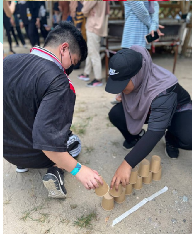
Collection pictures of games for each station