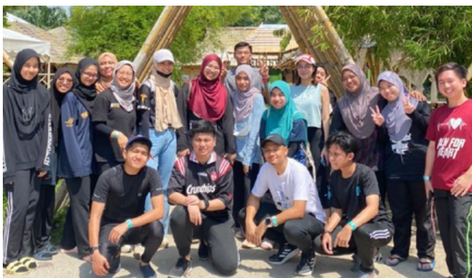
USSA club members

The competition between the groups was fierce and can be seen as dirty plays were caught red-handed by the judges, but it was all for fun, and no one was harmed in the space. After that, they played a Scavenger hunt.