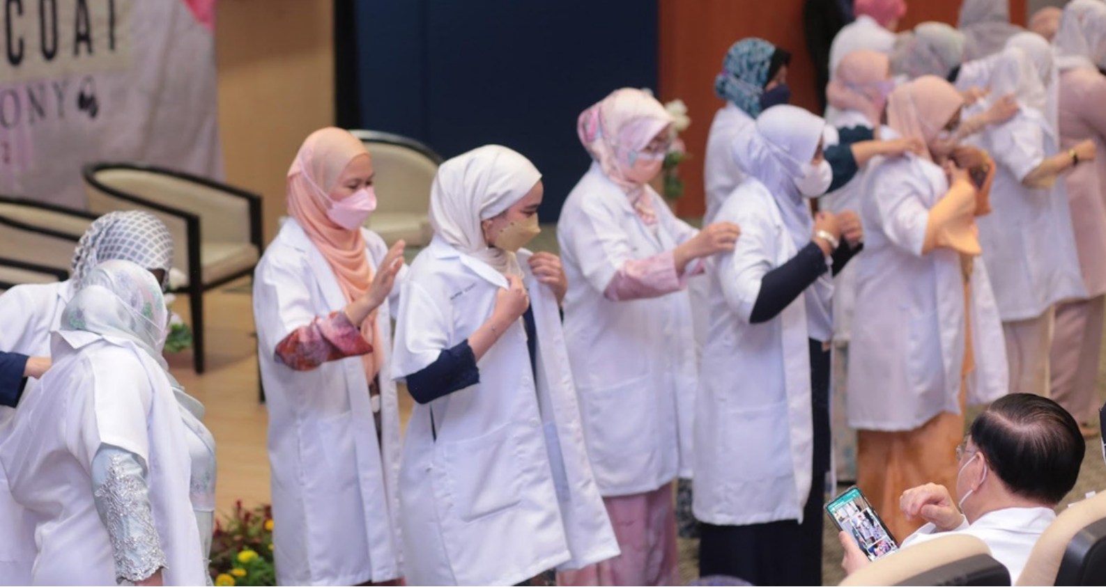
The lecturers placed the white coat on each student's shoulders