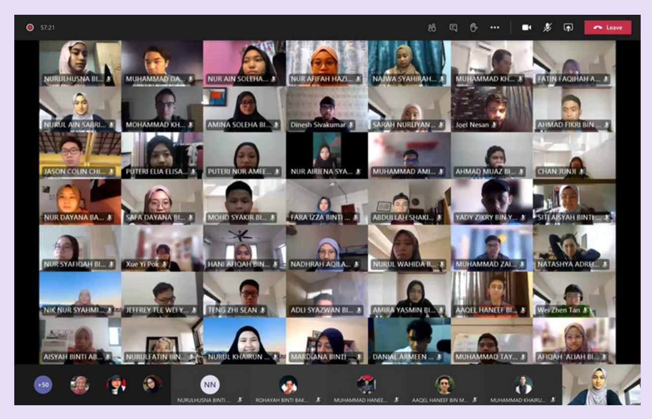
Participants of Tour De Medicine from both UiTM and University of Malaya

In short, these two programs that I had mentioned were just a teaser for many more of our exciting programs which are yet to come. So be sure to anticipate our next program!